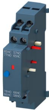
signaling switch for circuit breaker 3RV2 with screw terminal